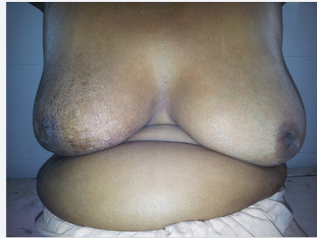
Figure 4: After complete clinical and radiological remission of disease.

(Figures 3 & 4) After complete clinical and radiological remission of disease with NACT and radiotherapy, pt was put on Hormone Therapy (Tab. Letrozole). She was regularly followed up and her status remains disease free to this date.