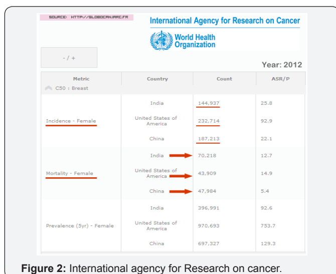
Figure 2: International agency for Research on cancer.

a. For a complete and optimal therapy for breast cancer, a multidisciplinary approach with input from the patient, the surgeon, the radiation oncologist, the medical oncologist, the diagnostic radiologist, the pathologist, the general practitioner, nurses, and other health professionals is needed.